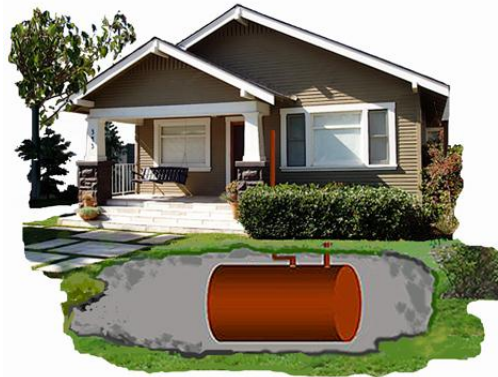
Non-invasive Bio-Remediation or Contamination Removal Cleanups.